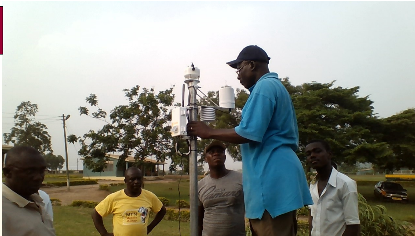
TAHMO Generation 2 Station being installed by staff of the Ghana Meteorological Agency

TAHMO seeks to develop a dense network of hydro-meteorological monitoring stations in sub-Saharan Africa: one every 30 km. This entails the installation of 20,000 such stations.