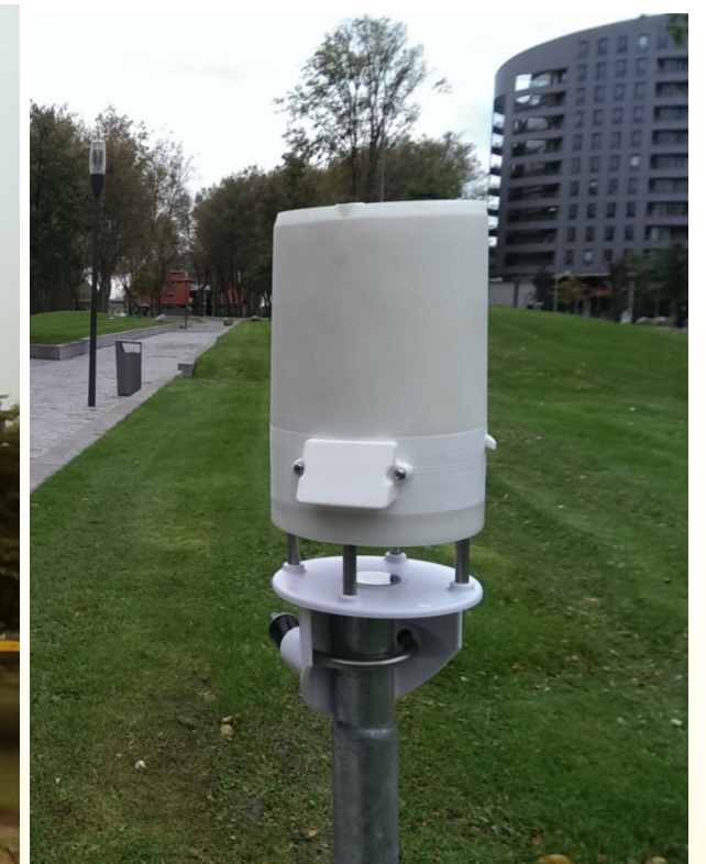
Mock-up of TAHMO MEM Station